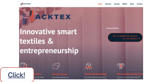
Hacktex project website

Check out the Hacktex website to be aware in detail of the Project progress, its milestones and achievements. The site is organized through an intuitive and atractive design that allows the visitor to quickly get a general overview of the project as well as more specific expected results. It is already prepared to host the MOOC on smart textiles that will be launched in the upcoming months.