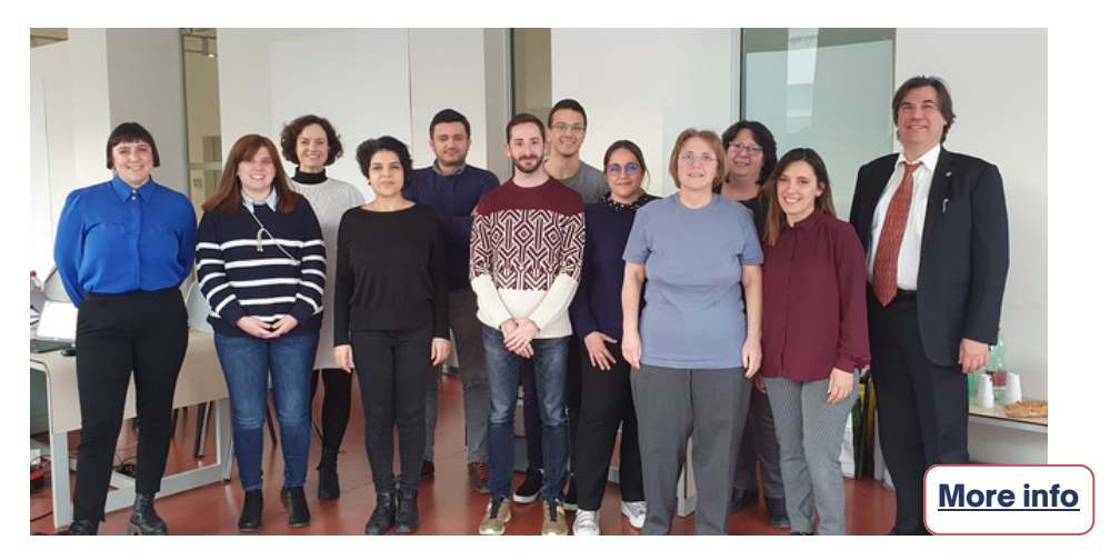
HACKTEX 3rd Transnational Project Meeting

Also, the intensive course (R3) was conceptually defined and partners agreed on a date: next November! Finally, regarding the R4, TITERA presented their proposal on how to proceed with the entrepreneurship guide focusing on smart textiles.